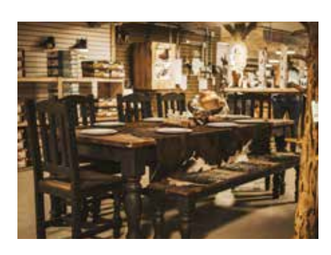
Irvine's Tack and Western Wear

Day Tours Cost $75 Bus leaves the hotel lobby at 10:15 am