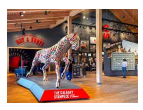
SAM Centre

5:45 pm Depart from lobby to Jubilations Theatre