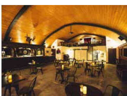
Eau Claire Distillery