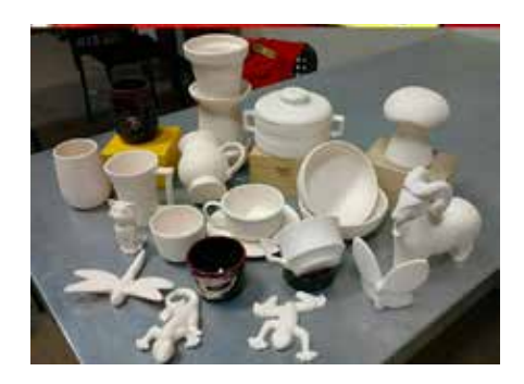
Fire Escape Studio (Image: Fire Escape)