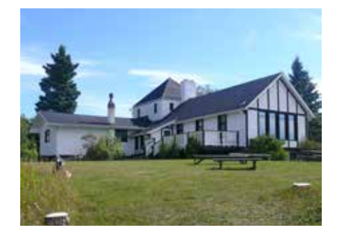
Leighton Art Centre

The Leighton Art Centre is a nonprofit public art gallery, museum, and education center located near Millarville, Alberta, 45 minutes southwest of downtown Calgary. Situated on 80 acres of foothills grasslands, the center offers panoramic views of the Rocky Mountains and serves as a hub for art, nature, and history enthusiasts. The Leighton Art Centre encompasses a heritage home, museum, galleries, and outdoor trails. It hosts year-round educational programs, workshops, and exhibitions featuring contemporary artists. Visitors can explore the gallery shop, which features works by numerous Alberta artists. They can also enjoy the natural landscapes through the center's outdoor trails or relax on one of the benches and take in the 180-degree panoramic view of the foothills. https://leightoncentre.org