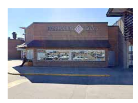
Forbidden City Restaurant

Just a short walk across the parking lot from the hotel to the Forbidden City Restaurant featuring a variety of Chinese dishes with seafood specialties (a la carte menu; dinner at your own expense).