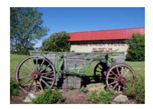
Nose Creek Valley Museum